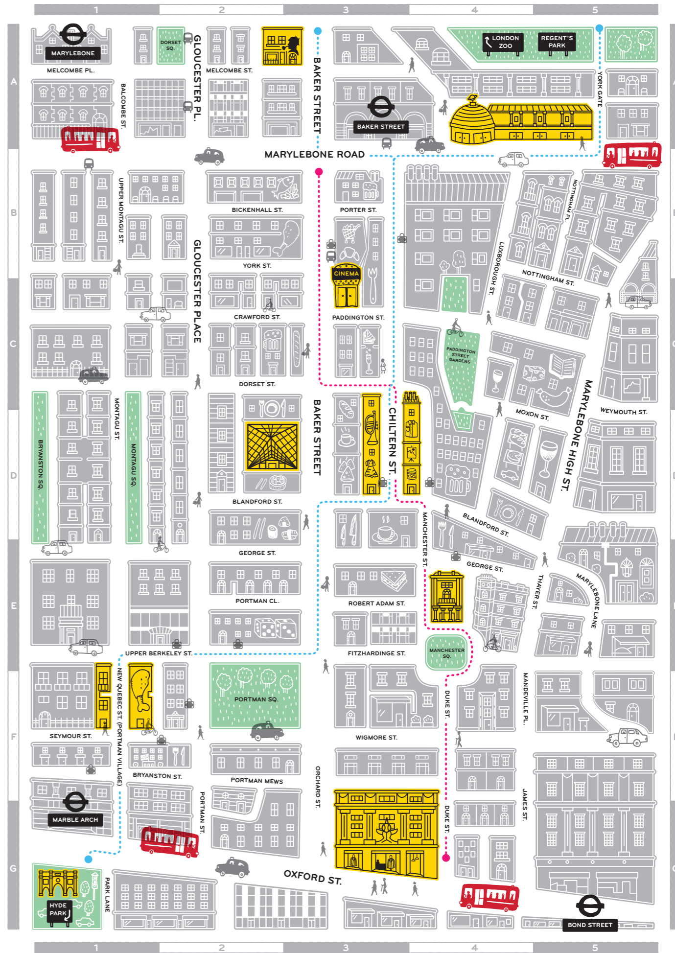
1 MINUTE WALKING DISTANCE

Outer Circle, the tree-lined ring road around the park, inside which you'll find 166 hectares of grass and gardens, originally appropriated as a hunting ground by King Henry VIII. Put paddle to water on the boating lake, or rise to the challenge of finding the St. John's Lodge secret garden – a peaceful, meditative park within a park.